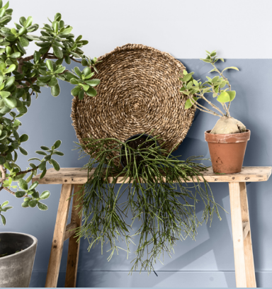
Blueberry Mash 14BB 55/113

Refreshing blues; these tones can make any room feel in touch with the natural world, helping to bring tranquillity into the home.