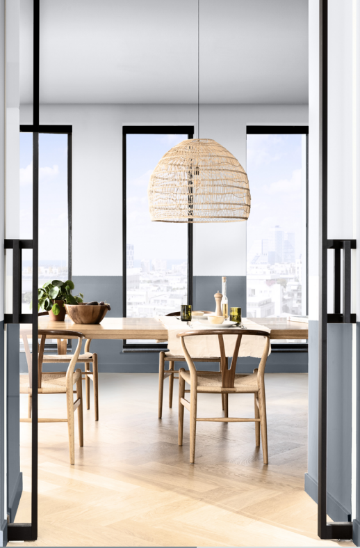
Horizons 10BB 73/039