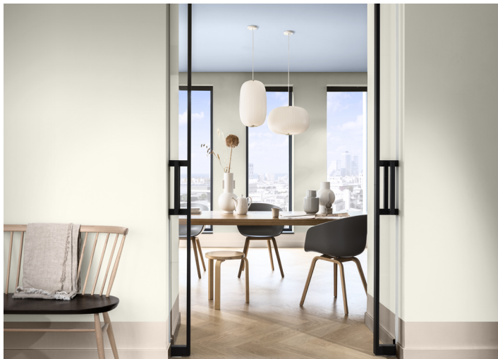
City Life 44YY 65/034